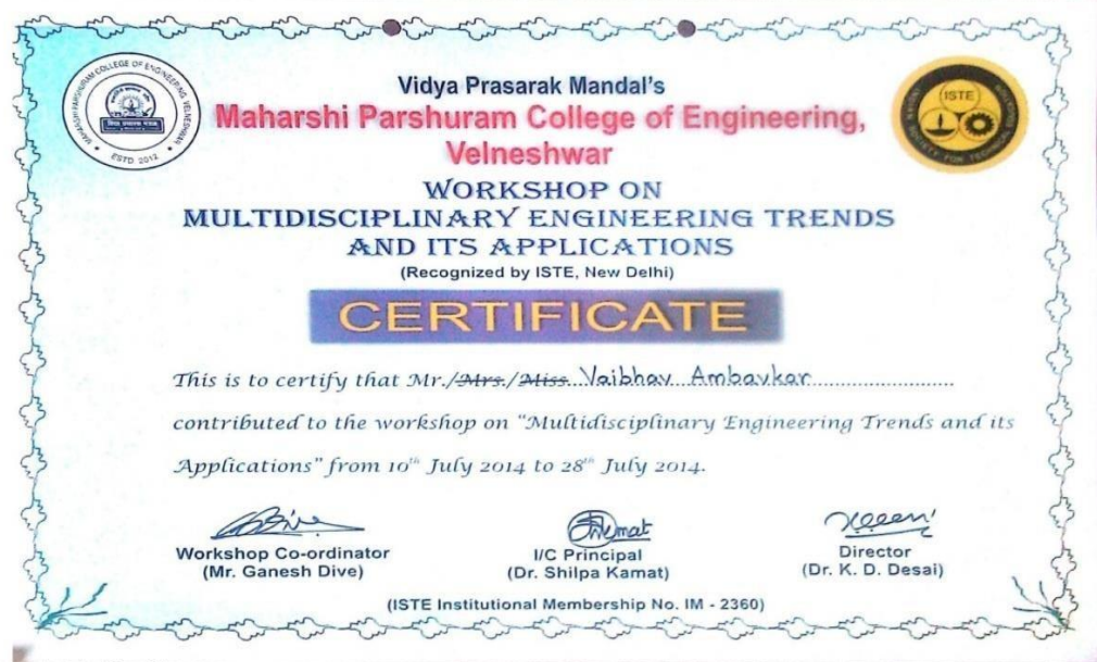
Generated by CamScanner